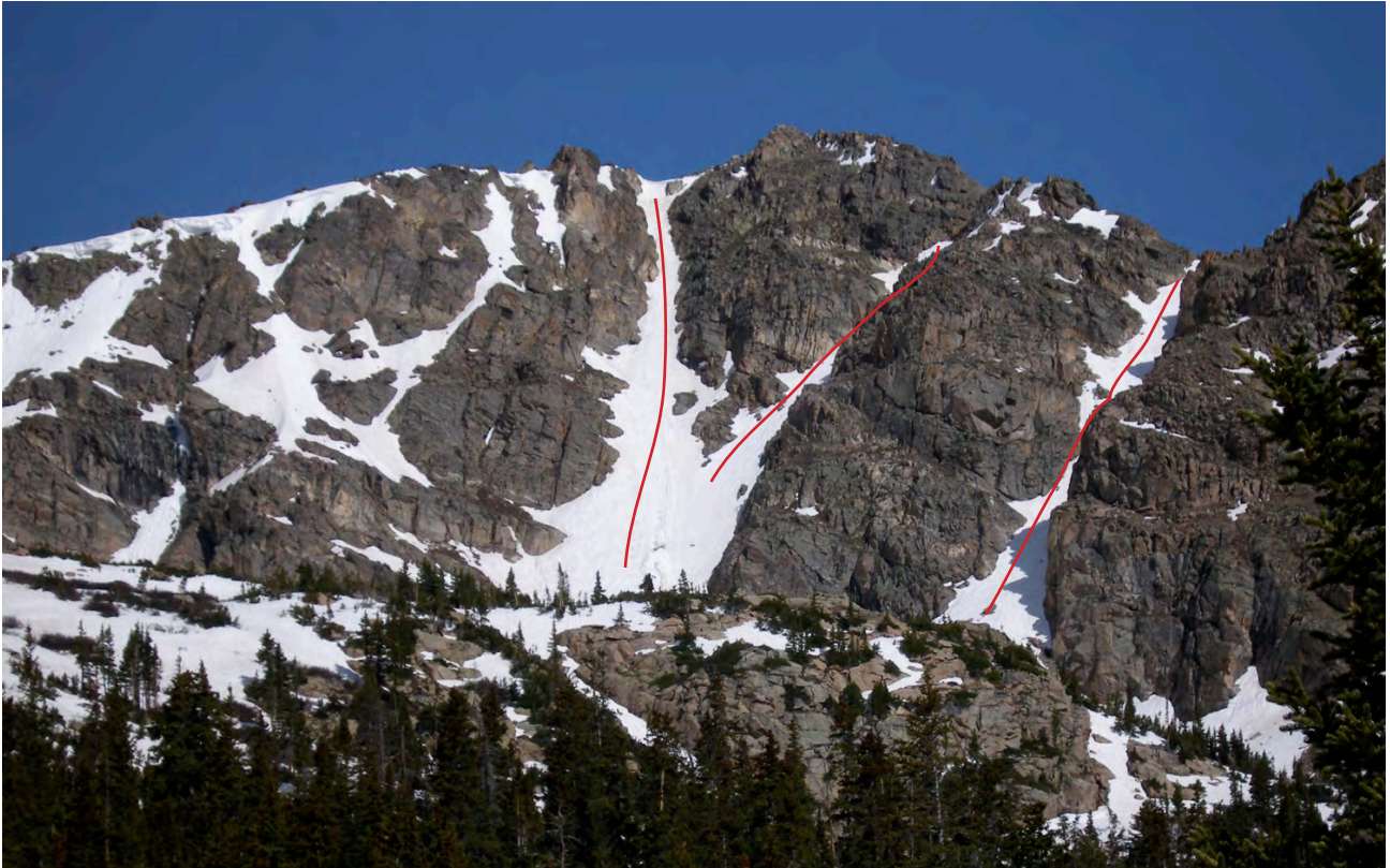
Two views of the same three couloirs. All are fun, the main one on the left is the most popular and best approached from the mellow South Ridge. The obvious cornice at the top of the main couloir can usually be avoided by entering the couloir from skiers left.